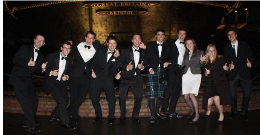
Some of the current committee members at the Western Region yearly meal (we scrub up well, don't we?)

We look after the needs of local young members in Bath, Bristol and surrounding areas through events such as lectures, training days and beer/curry nights!