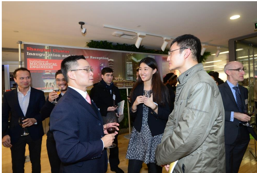
Networking after the ceremony