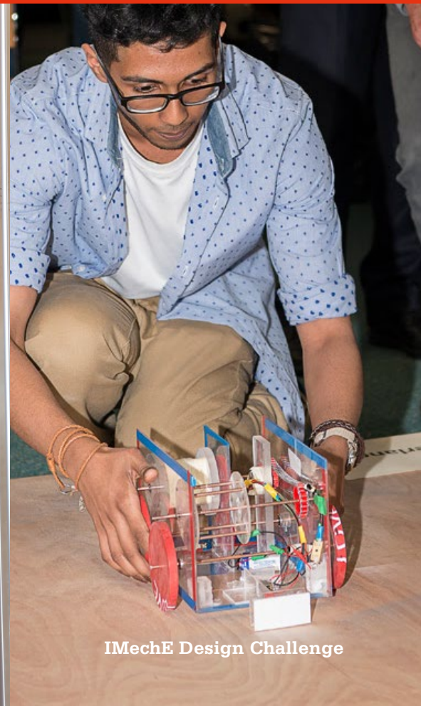
IMechE Design Challenge