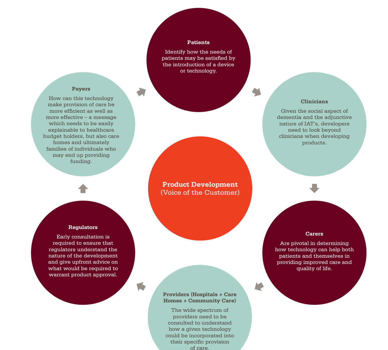
Figure 1: IAT Product Development Cycle<sup>[8]</sup>

Human assistance will become more remote at a higher level, and will involve supervision of many more patients. To maximise the benefits – both social and economic – of IATs, they need to be compatible with, and integrated into, healthcare systems and services. This will require further investment in IT infrastructure to ensure reliable, detailed and semiautomatic remote monitoring of individuals.